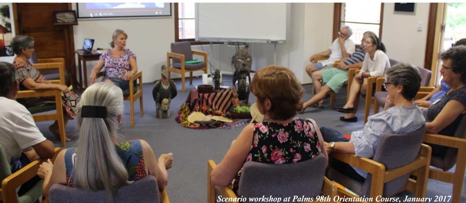
Scenario workshop at Palms 98th Orientation Course, January 2017

Before you, over 1530 Australians, at 104 Orientation Courses, have been prepared to engage in these challenging cross-cultural relationships to build understanding, acceptance and care, and provide the assistance requested, across 40 countries in Africa, Asia and the Pacific.