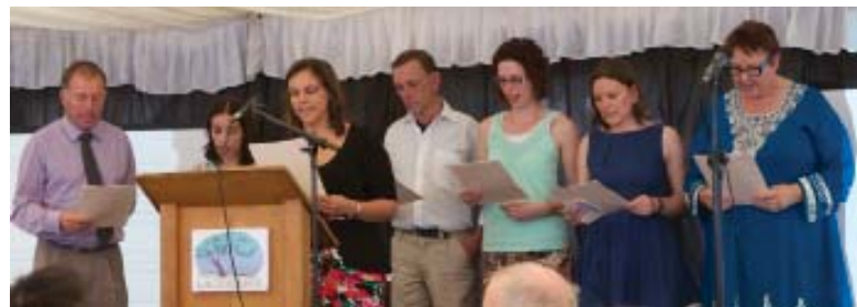
The Solidarity Volunteers make the Palms Pledge

Seven participants completed the course, taking their pledge and receiving certificates at our 2nd Annual Solidarity Awards.