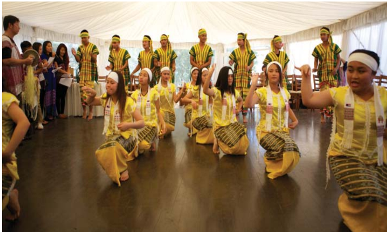
The Australian Karen Organisation performs Burmese traditional dance at the 2nd Annual Solidarity Awards